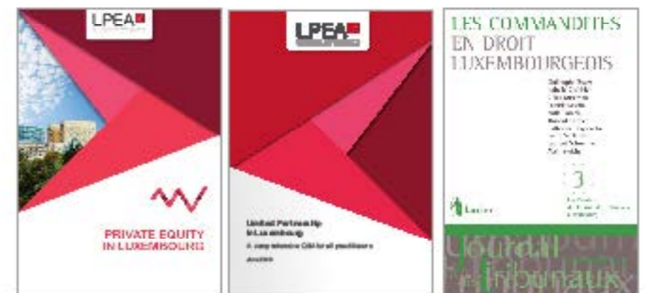
Private Equity in Luxembourg (2016)