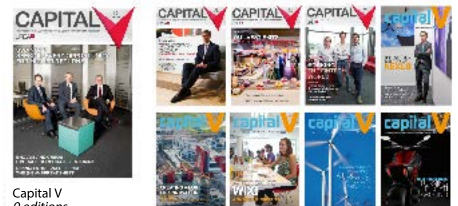
Capital V 9 editions