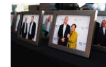
PHOTO PRINT Your guests leave with a framed photo. Including 50 frames