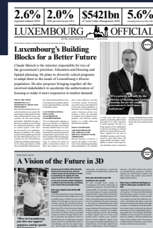
LuxembourgOfficial: Our freemium publication