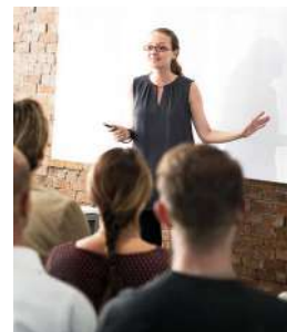
Consulting: 50 modules delivered in 3 hours