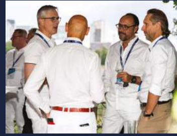
CEO White night