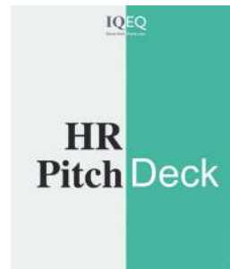
HR Suite: onboarding accelerator, benefits, etc