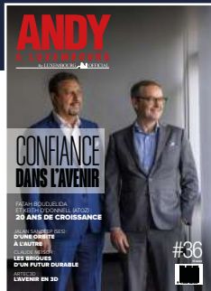
Andy: Business magazine in French