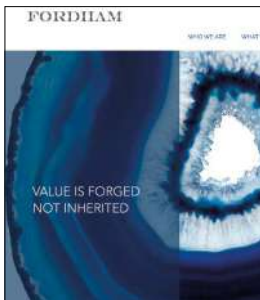
Websites: Simple website in 1 day