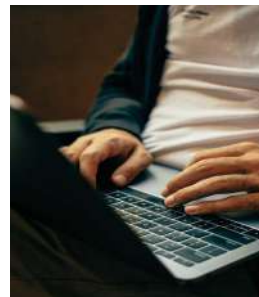
Boost your growth with LinkedIn