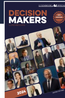
Decision Makers: The annual Luxembourg business directory