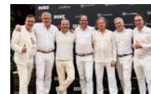
PHOTO STUDIO Great portraits of your guests