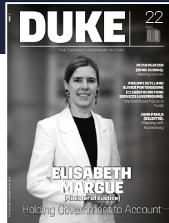
Duke: Business magazine in English